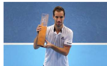
2016 Winner: Richard Gasquet

2022 Winner: Félix Auger-Aliassime | Highest ATP ranking: 6