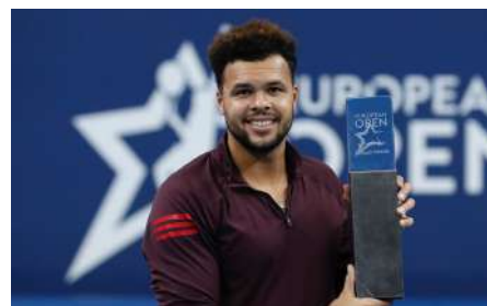
2017 Winner: Jo-Wilfried Tsonga