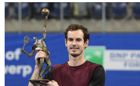
2019 Winner: Andy Murray