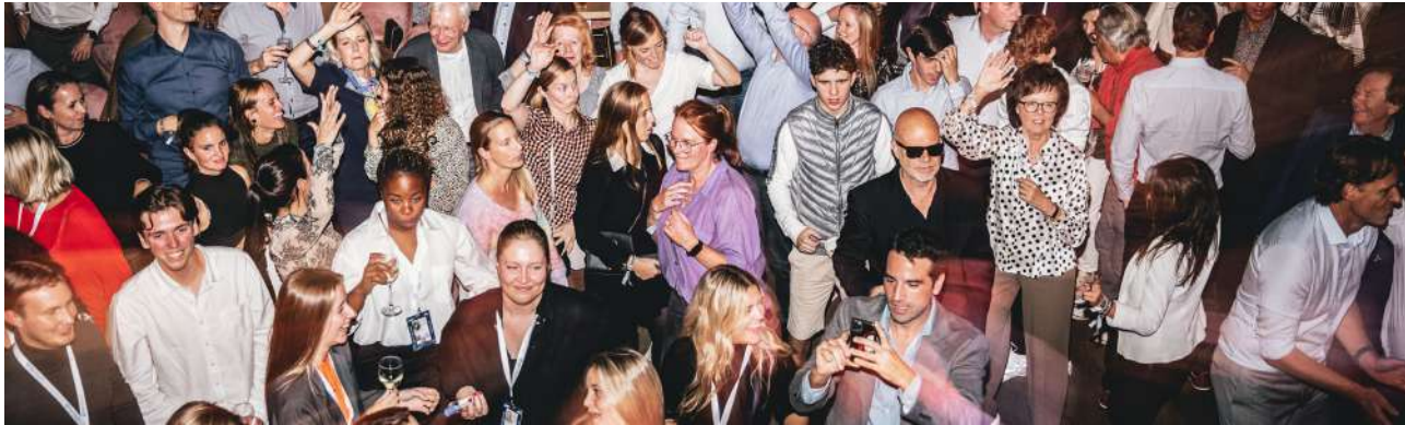
WALKING DINNER OR LUNCH