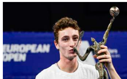
2020 Winner: Ugo Humbert