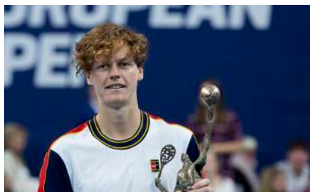
2021 Winner: Jannik Sinner

The European Open is part of the ATP World Tour and is the largest and only tennis tournament of this level in Belgium. As in every edition, the European Open will bring together several international and Belgian top players. It is a singles as well as a doubles tournament.